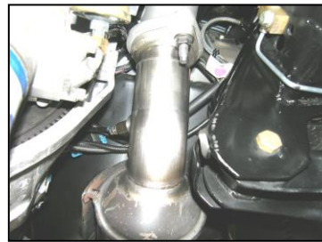
Examples shown – not actual parts